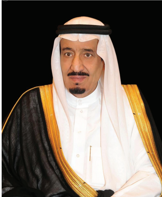
KING SALMAN BIN ABDULAZIZ AL-SAUD