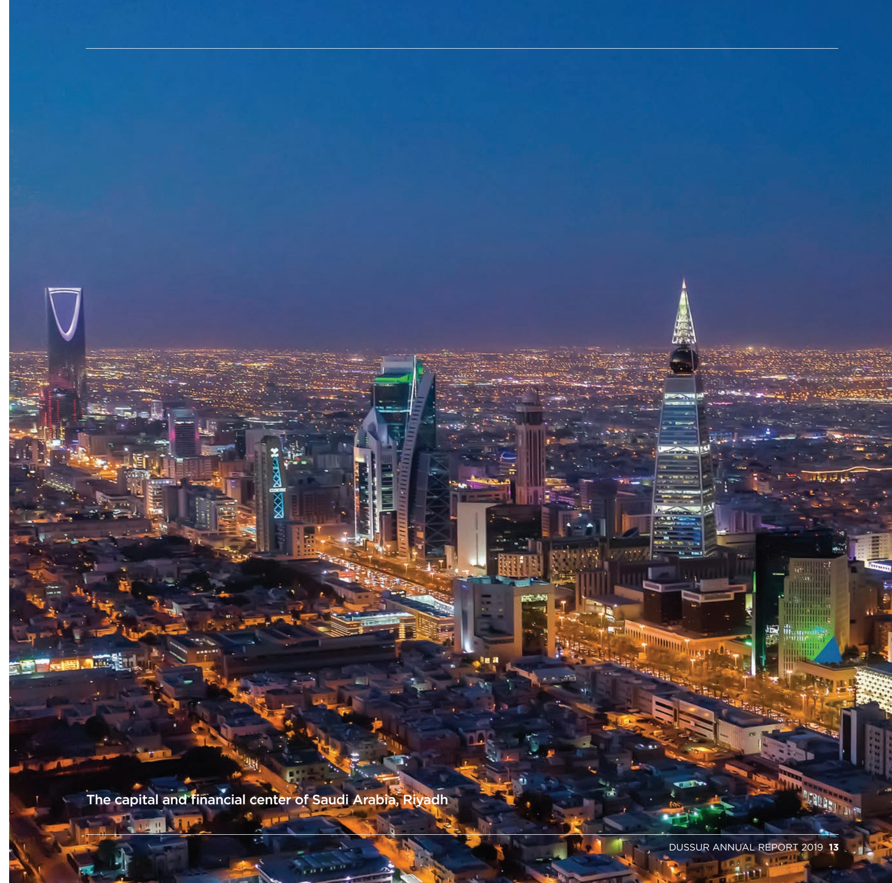
The capital and financial center of Saudi Arabia, Riyadh