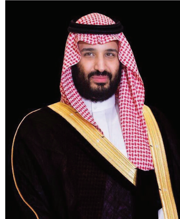
HIS ROYAL HIGHNESS PRINCE MOHAMMED BIN SALMAN BIN ABDULAZIZ AL-SAUD

Crown Prince, Deputy Prime Minister and Minister of Defense of the Kingdom of Saudi Arabia