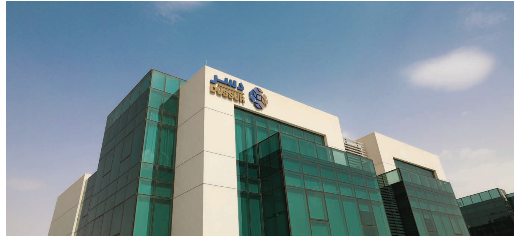
New Dussur Office, Riyadh Front